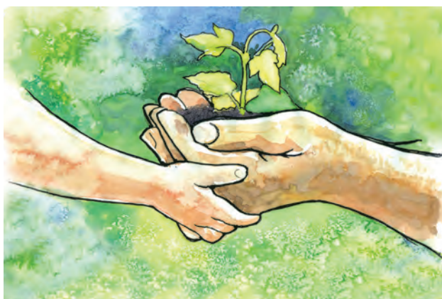
Conservation of environment : a legacy

The visible effects of the decline of environment are extinction of species of plants and animals, decrease in the fertility of soil, water shortage, fluctuation in the proportion of rainfall, global warming, drying up of rivers and lakes, pollution of rivers and seas, incidence of newer diseases, acid rain, thinning of the ozone layer, etc. Even if some of the effects are restricted to particular nations, these problems reach global proportions,