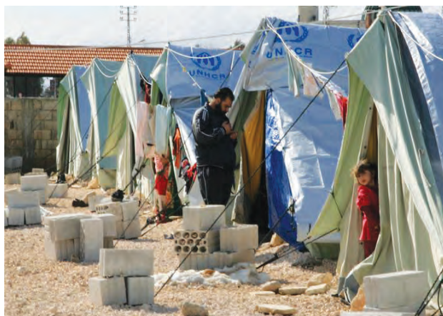
United Nation's aid to refugees

Before the Second World War, the Jews were tortured in Germany. Their citizenship and property was confiscated. Due to this, the Jews became refugees. In 1971, the people in East Pakistan turned refugees and came to India seeking refuge due to political and religious persecution. In the last few years due to the war-like